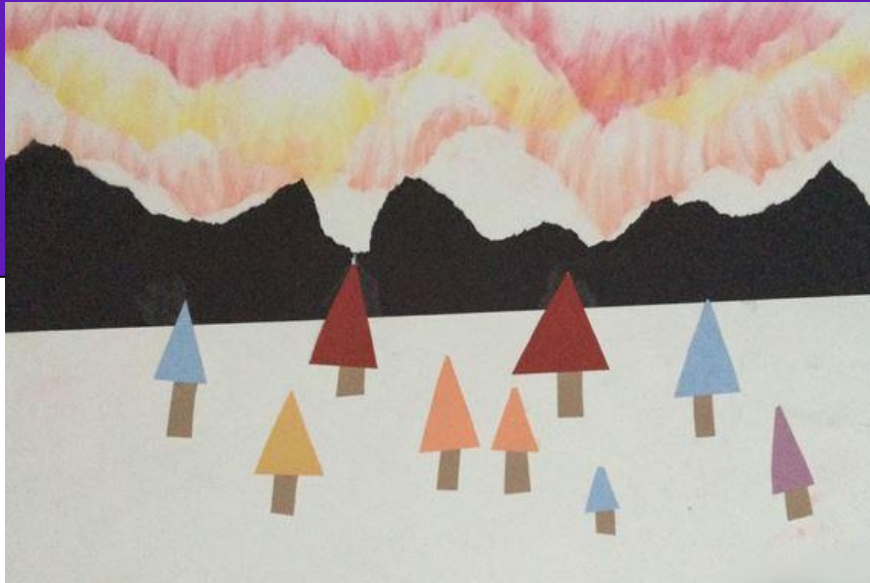
Serenity, 2nd Grade